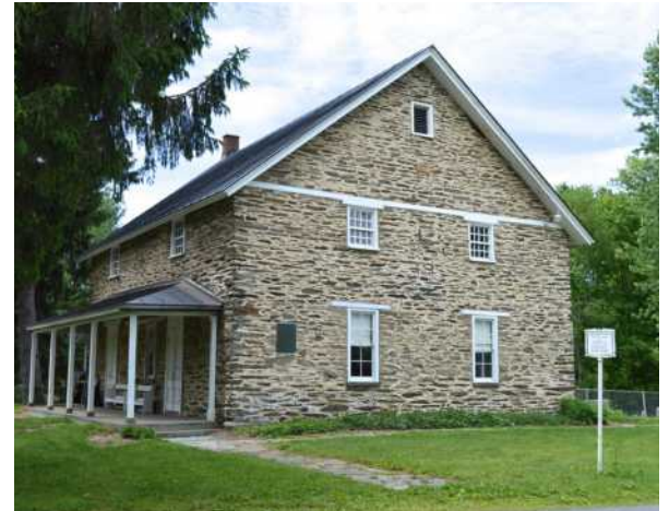
1777 CREEK MEETING HOUSE

2433 Salt Point Turnpike, Clinton Corners NY