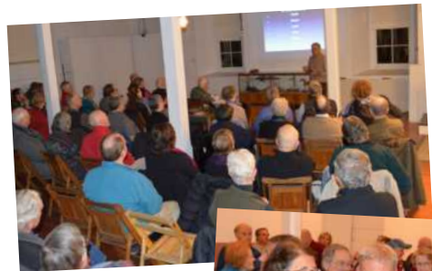
We host monthly program meetings and a December Holiday Potluck Supper and Auction.

The Society publishes a quarterly newsletter ( The Clinton Historian ) and books on local history as well as reproductions of historical maps. We maintain an archive, which is available for research by appointment. Our website contains digital archives and information on publications, programs, local history, and fundraisers.