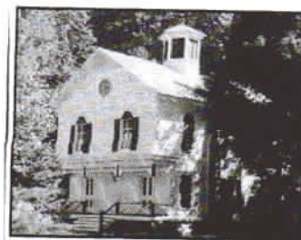
1865 Masonic Hall

We wish to again thank our Wednesday morning volunteers, past and present, who have given of their time for ten years, working diligently at our Society's Creek office.